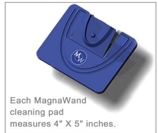
Each MagnaWand cleaning pad measures 4" X 5" inches.